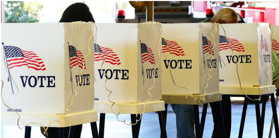
Smartmatic also marketed the integration, engineering, and manufacturing of the new voting system.

Spanish – How is this possible? It seems unusual. The company Smartmatic, which for a decade counted the votes of the electoral processes in Venezuela under the Socialist regime, now operates in the U.S. elections .